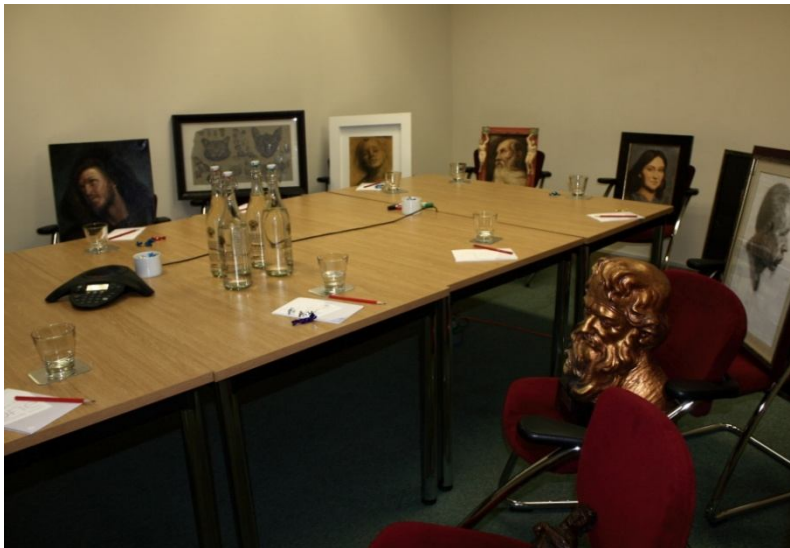
Idem Sonans in discussion (main installation)