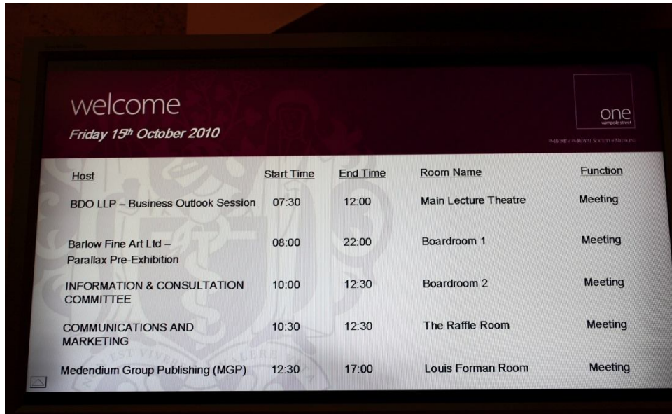
Video screen in the main reception of the Royal Society of Medicine

Parallax Pre-Exhibition II: ROYAL SOCIETY OF MEDICINE, 13th-16th OCTOBER 2010